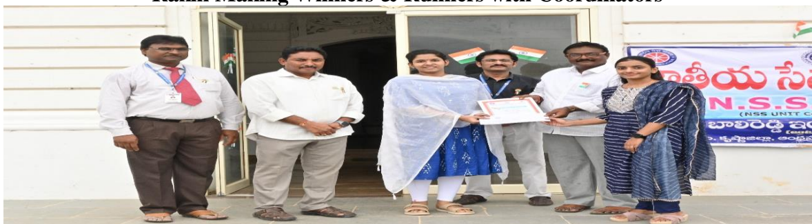
Rakhi Making First Prize Winners