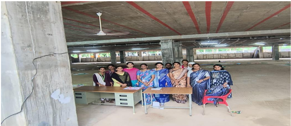
Rakhi Making Winners & Runners with Coordinators